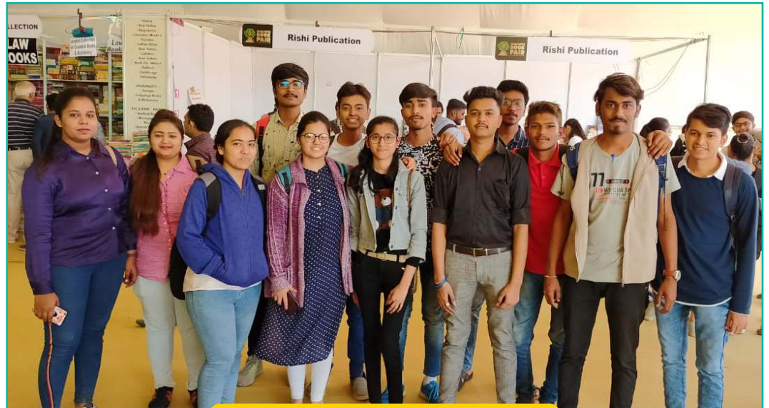
IT students with their faculty