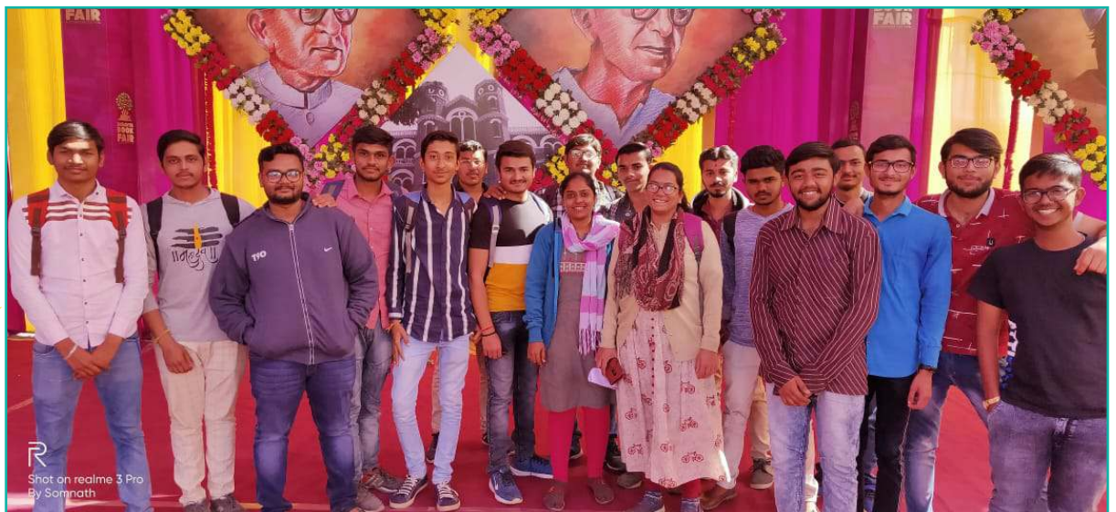
Mechanical students with their faculty