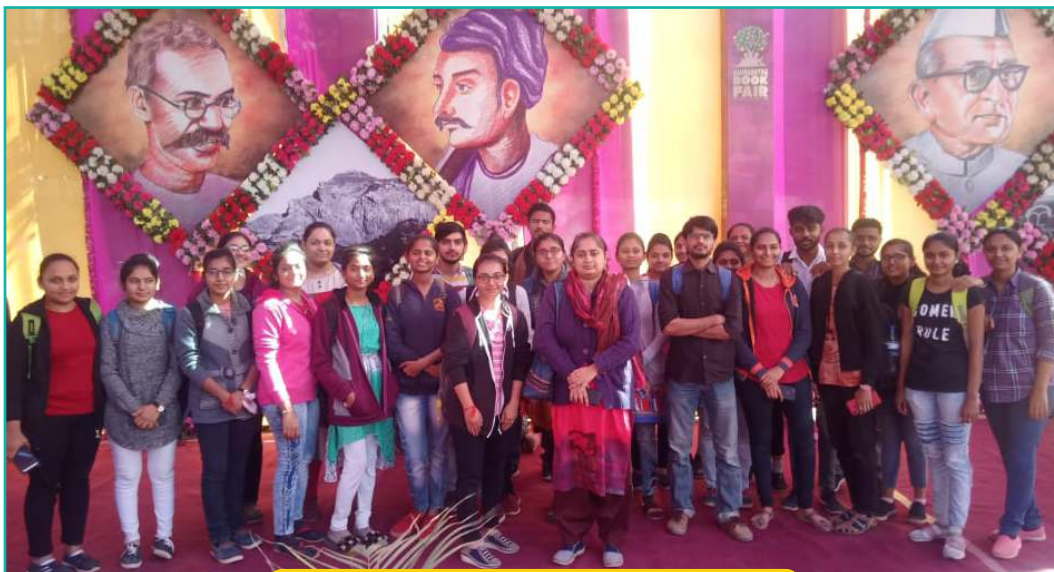
MCA students with their faculty