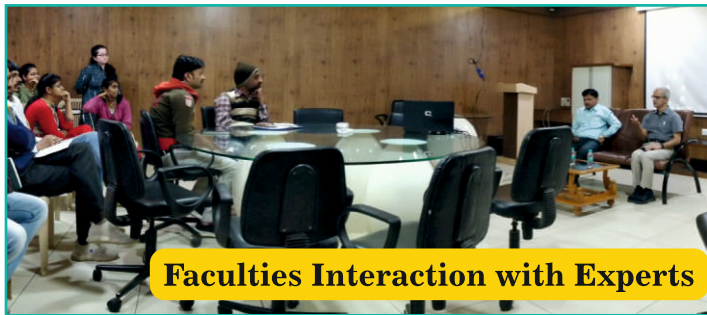
Faculties Interaction with Experts

B.H.Gardi College of engineering had organized a talk session with expert from SVNIT, Surat for guidance on PhD and stimulates research fruitful for faculties as well as society on 7th February, 2020