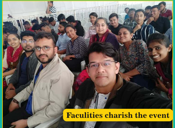
Faculties cherish the event

Besides, book fairs are now educational and cultural events. There are seminars, panel discussions, presentations, author meet-ups, etc to keep the exhibitors and visitors engaged and to spread knowledge. Then, there are also various cultural activities at the book fairs, which is another attraction for the visitors. Students attended session